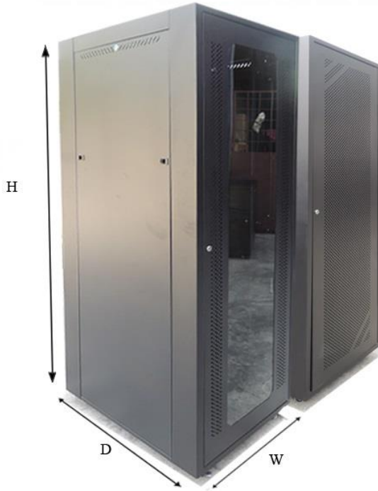
FRONT TEMPERED GLASS DOOR OR FULLY PERFORATED DOOR